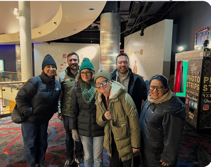
Just Another Night at the Movies...

Every Sunday, regardless of how busy our week has been, we make it a point to go out for dinner and see a movie. It's always a relaxing way to end the week, a time for us to share our stories about everything that happened throughout the week , and even more importantly, we can share our stories about all the fun we have in store for the week ahead. Sometimes we even go with movie stars like Amy Poehler, Maya Rudolph and Tina Fey. It's these moments that your child will remember and fill their life with joy.