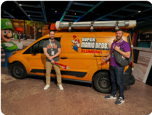
The Best Plumbers!