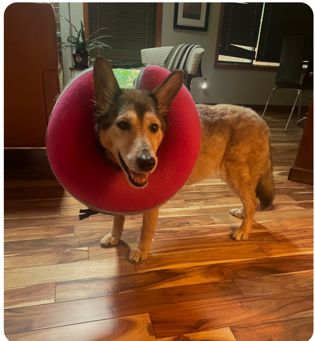
Ready for a Walk

No matter how demanding our days might be, one thing remains constant: our daily walks with Paca . These daily walks allow us to connect, reflect, and appreciate the beauty of our community . Just recently, during one of these walks, we stumbled upon baby bunnies in a nearby park. While Paca could not have been less interested in the bunnies, getting to see such cute little creatures definitely made for an exceptionally memorable evening. It's moments like these that we cherish, serving as a beautiful reminder why we prioritize spending quality time together. We can't wait to share quality family time each and every day with your child.