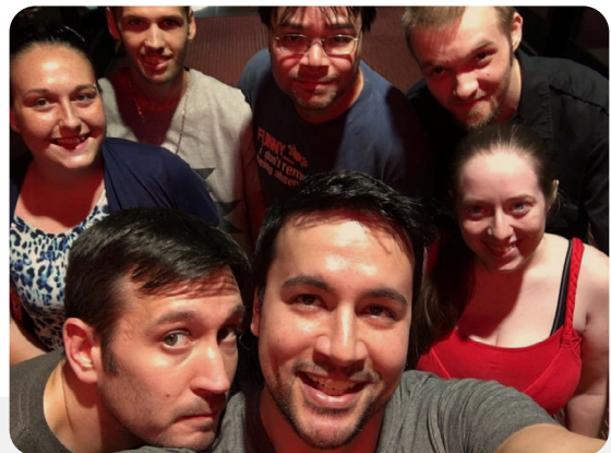
A Blacksburg Thanksgiving