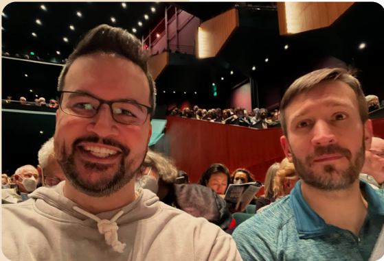
At the Opera