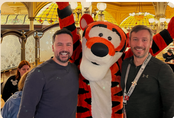
Us and Tigger