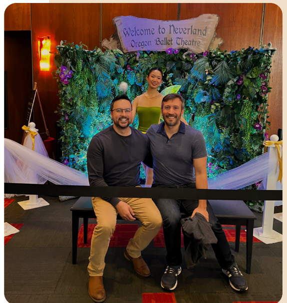
With Our Pal, Tinkerbell