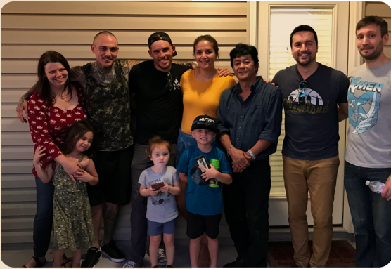
With Our Family