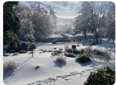
The Rare Winter Storm