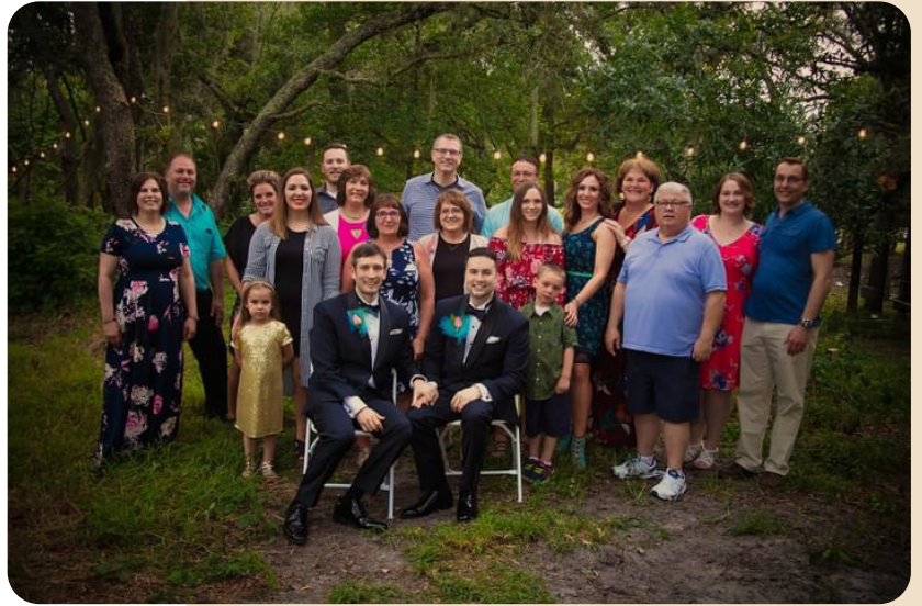
Cousins, Aunts and Uncles