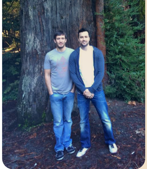
At Sequoia National Forest